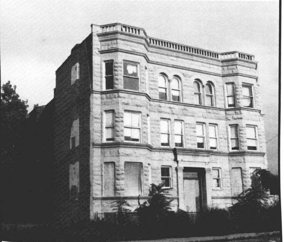
4219 S. ELLIS

This building is one of five that KOCO will develop as a result of a $1 million loan received from Harris Bank through the Neighborhood Lending Program. The loan closed early this month. KOCO and Covenantal Development Corp. were the first two non-profit groups to close with Harris, out of a package of nine groups. The rest will close in the coming months.