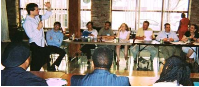
Commissioner Mike Quigley speaks to CRN members and staff during quarterly membership meeting in the south Loop.