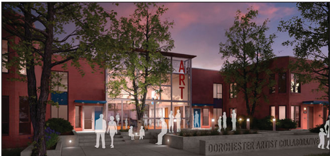
These vacant CHA apartments at 70th Street and Harper Avenue in the 5th Ward are among 32 two- and three-bedroom units slated for redevelopment as artists' residences.

The $11.8 million development, a joint venture of Brinshore Development and the nonprofit Rebuild Foundation, is part of the CHA's Plan for Transformation. The Rebuild Foundation, whose mission includes providing arts programming for children, plans to provide programming in the arts center, coordinating artists living on-site who will be required to volunteer a minimum of five hours per week. This project will also be part of a larger network of artists' residences being established by the Foundation in six midwestern cities.