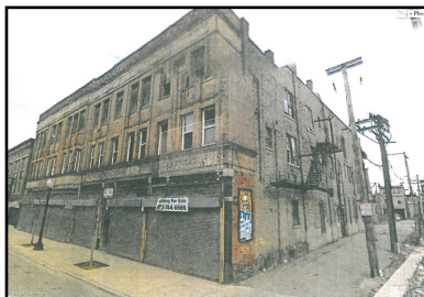
This blighted commercial building at 436 E. 47th Street in the 3rd Ward will soon be reborn as Bronzeville Artist Lofts with the assistance of $4.4 million in NSP2 grant funds.