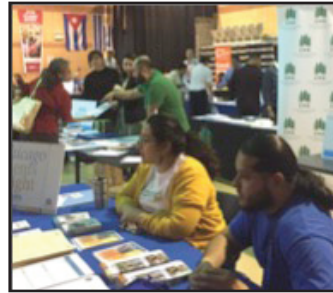
Prospective home buyers were able to learn more about the City's new Home Buyer Assistance Program at this April 16 workshop.