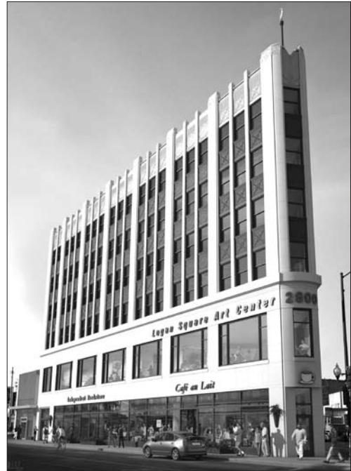
The historic renovation of Hairpin Lofts will revitalize the six-points intersection of the 21st Ward's Logan Square community, creating 25 affordable units, retail space, and a community arts center.

The City is providing substantial financial support for the project, including the sale of the land, valued at $3.9 million, for a dollar, and $7.1 million in TIF assistance from the Fullerton / Milwaukee TIF. The TIF funds will be used to off-set the costs of developing the rental housing, of which 90% of the units will be affordable and also help cover the cost of rehabilitating a landmark building to the LEED Silver level.