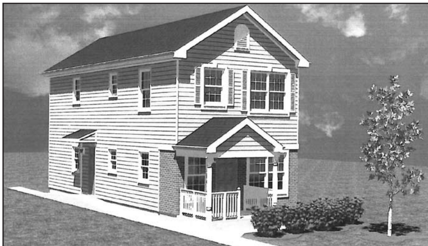
Englewood Estates will create 15 new affordable single-family homes at scattered sites throughout the West Englewood community of the 15th Ward.

The City is providing the land and $75,000 in site improvements to the developer along with $600,000 in financial assistance to buyers so the homes can be sold at affordable prices. City assis-