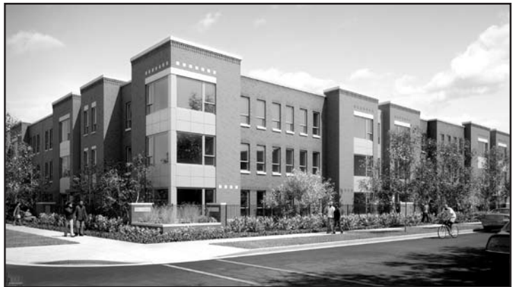
Park Douglas Apartments, will utilize 27 City owned parcels to create 137 units in 19 buildings in the 28th Ward's Lawndale community.

Park Douglas will be constructed on 27 vacant City-owned parcels and consist of 19 multi-unit, mixed-income residential properties and include 49 units for households at or below 60% AMI, 60 public housing units for households at or below 50% to 60% AMI, and 28 market rate rental units. This complex will also include a maintenance facility, management office, community space, and social service offices.