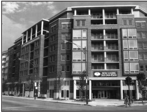
Parkside of Old Town will create 112 new mixed-income units in the 27th Ward.

Building amenities will include a community room, exercise room, laundry facilities, bicycle storage room, street-level commercial spaces, and a parking garage.