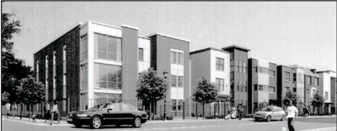
As part of the CHA Plan for Transformation, West End/Rockwell Phase II-A will create 115 new mixed-income units in the 2nd Ward's Near West Side community.

by West End/Rockwell, LLC and located in an area bounded by W. Adams to the north, W. Van Buren to the south, S. Artesian to the east, and S. Maplewood Ave. to the west in the 2nd Ward's Near West Side community.