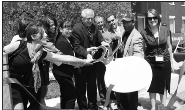
Governor Pat Quinn cuts the ribbon at the grand opening of the Rosa Parks Apartments in the 27th Ward's Humboldt Park community. This development has created 94 new units of affordable housing for Chicago residents

In June DCD officials joined community leaders, members of the development team and others in celebrating the grand opening of Rosa Parks Apartments, a new 94-unit affordable rental development located in the area bounded by Kedzie and Drake avenues, Huron Street, and Franklin Boulevard in the Humboldt Park community of the 27th Ward.