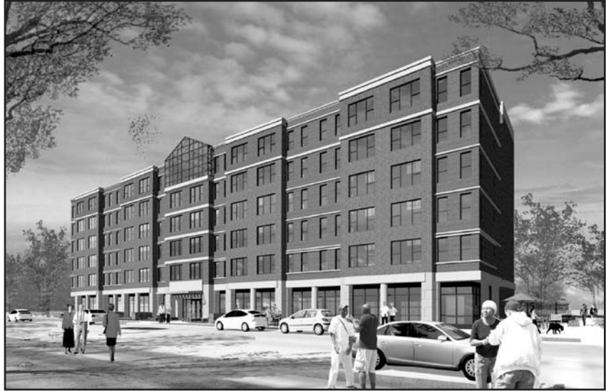
Oakwood Shores Senior Apartments will create 76 Section 202 units of affordable senior housing in 4th Ward's Oakland Community.

In May the Chicago City Council approved financing for the new construction of Oakwood Shores Senior Apartments, a 76-unit senior building being developed by Oakwood Shores Senior Apartments L.P. and The Community Builders Inc. This development will be located at 3750 S. Cottage Grove Ave. in the 4th Ward's Oakland Community.