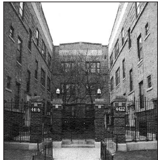
DCD is preserving 59 project based Section 8 units at the Clifton Magnolia Apartments

This investment will preserve two properties previously at risk of loss to the affordable housing market. As vital affordable housing resource in the Uptown community, revitalizing and preserving these 59 units prevents displacement of low-income families and contributes to maintaining a vital mixed-income community.