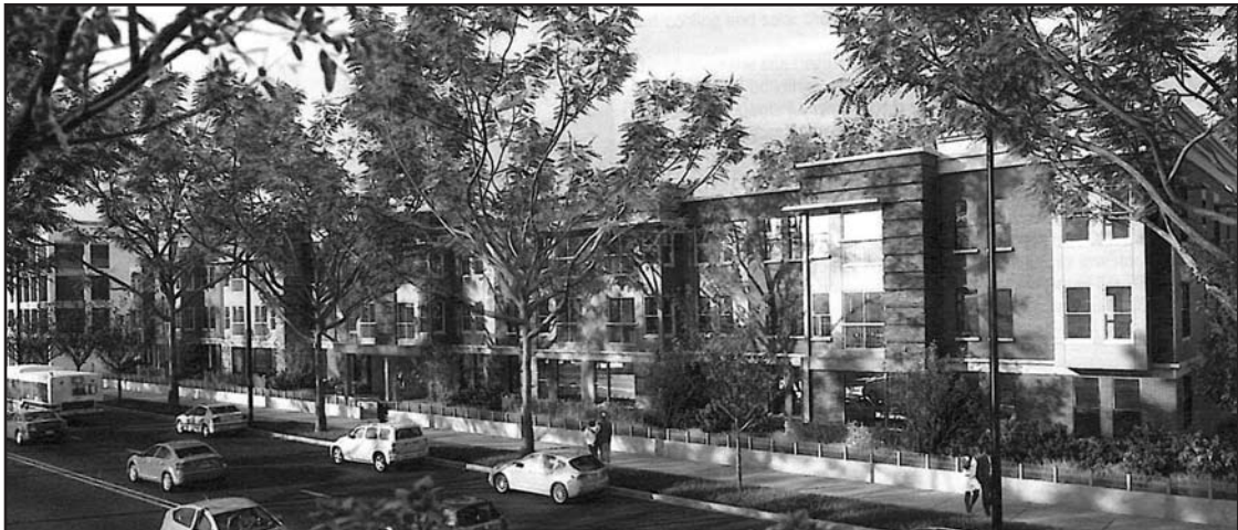
Woodlawn Center South will begin the transformation of the former Grove Park Apartments, creating 67 new affordable units in the 20th Ward.

City financing for this $20,958,114 development will include a $3,063,415 HOME loan. Woodlawn Center South is being developed by WSC Preservation Associates, L.P., and Preservation of Affordable Housing, Inc. (POAH).