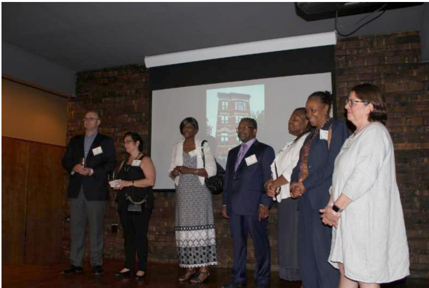
CRN honors Board of Directors.

Support our Mission: With your help, we can build strong neighborhoods, strengthen capacity, and create powerful leaders.