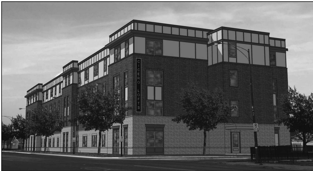
This four-story senior complex will be built on a 1.5-acre site previously occupied by a motel near Midway Airport.

The City's financial assistance will include a $2.3 million loan and $1.7 million in Low Income Housing Tax Credits generating $16.5 million in equity. The $20.3 million project is being developed by MVAH Partners, which since 1993 has produced more than 6,000 affordable housing units in fifteen states.