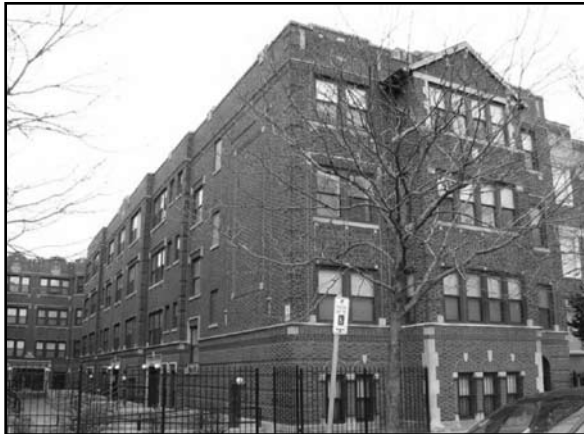
This courtyard building at 6105-15 S. Ellis is one of six Woodlawn properties being rehabbed through the Renaissance Apartments redevelopment.