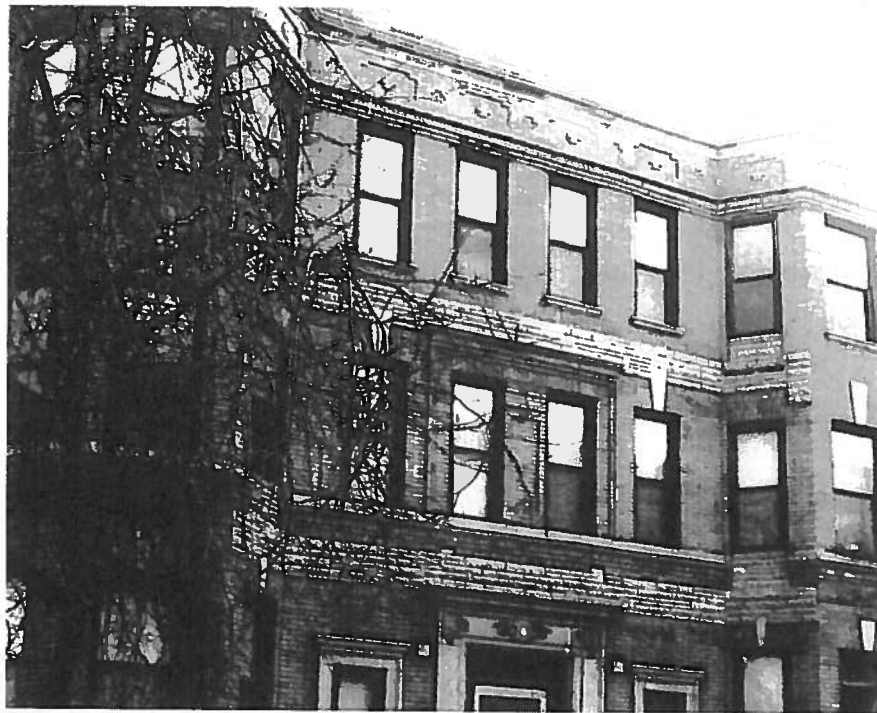
Hazel Winthrop Apartments will create 30 affordable units in the Uptown community of the 46th Ward.

The total affordable development cost of Hazel Winthrop Apartments is $11,508,669, and includes: a HED HOME Loan of $4,000,000, Low-Income Housing Tax Credit equity of $352,277 generating $2,888,669 in equity, up to $8,000,000 in municipal bonds, and standard Multifamily Program Fee Waivers.