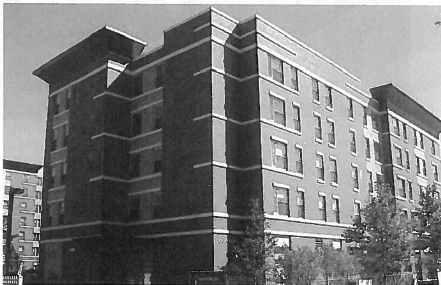
Casa Maravilla created 73 units of affordable rental housing in the 25th Ward’s Pilsen community area.

Casa Maravilla was developed by The Resurrection Project.