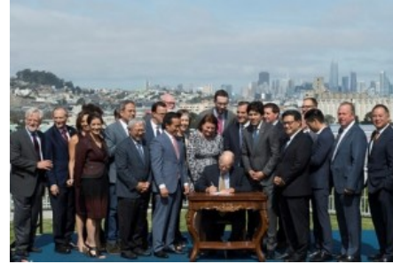
From Affordable Housing Finance.

On September 29, California Governor Jerry Brown signed a historic housing legislation package. The package, which includes 15 new bills in total, seeks to expand affordable housing through a variety of measures in order to address the state's housing crisis. Highlights include SB 2 by Sen. Toni Atkins (D-San Diego) which will impose a $75 fee on certain real estate documents raising an estimated $250 million per year, SB 3 by Sen. Jim Beall (D-San Jose) which will place a $4 billion bond for affordable housing on the state ballot, and SB 35 by Scott Wiener (D-San Francisco) which speeds up housing approvals in cities not currently meeting their housing goals. You can read more about the new legislation here .