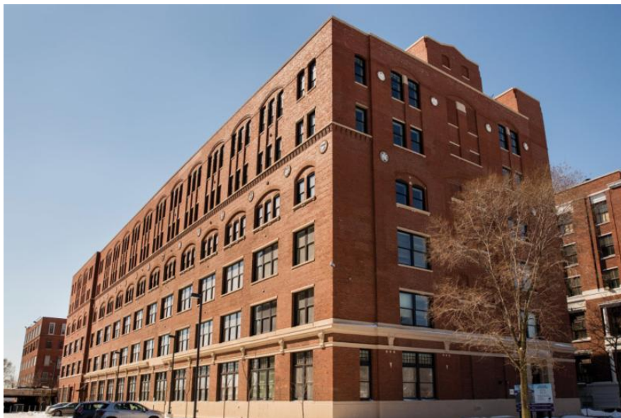
From Affordable Housing Finance.

Along with nine other developments around the country, Mercy Housing Lakefront's project converting Chicago's iconic Sears catalog printing facility into 181 units of affordable housing has won a 2017 Readers' Choice Award from Affordable Housing Finance. The Lofts on Arthington, an adaptive-reuse project located in Homan Square, will provide a mix of one, two, three, and four bedroom units for families at 30% and 60% AMI. Residents will have access to services including pre-K education, neonatal healthcare, and job training. You can read more about the Lofts on Arthington here and about the other AHF winners here .