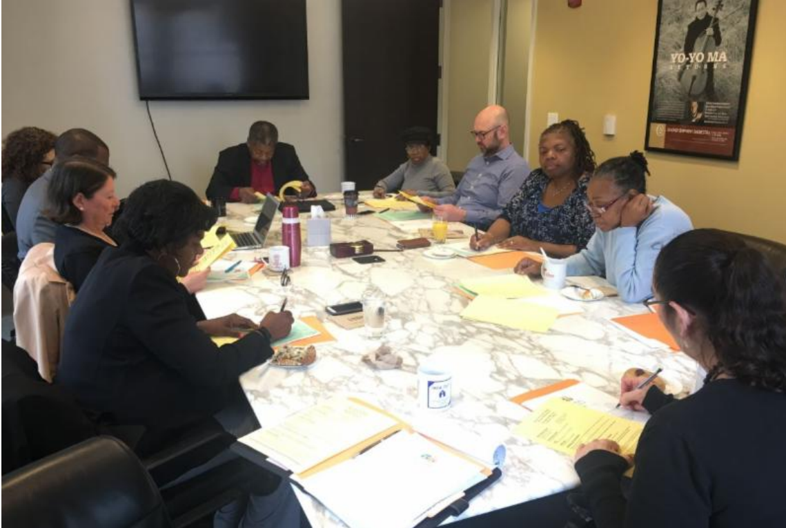
CRN leadership reviews board documents and prepares for a summer of impact for neighborhood development and affordable housing.