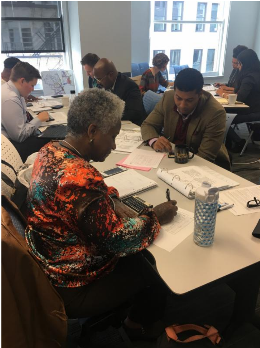
Students practice financial calculations during this month's Finance Skills for Real Estate Class.

Save the Date: CRN Membership Meeting June 12th 9:00 AM, Details TBA